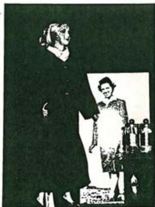
Portrait #6: University College of the Cariboo 1973 Graduation Uniform