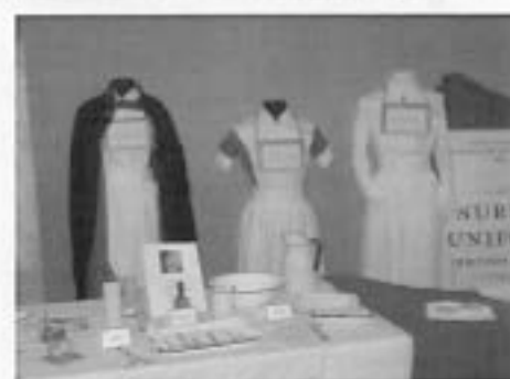
Historical nursing uniforms