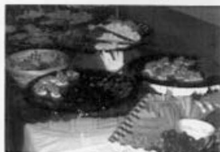
A reception of cocktails and finger food followed the opening welcoming session.