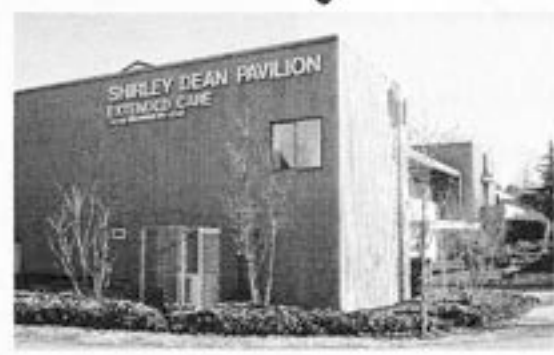
The Shirley Dean Pavilion was formerly the King George Private Hospital and was purchased by Surrey Memorial Hospital in 1983

On October 29, 2003, the residents and their families of the Shirley Dean Extended Care Pavilion located on the campus of the Surrey Memorial Hospital in Surrey BC, were told their home would be closing in June 2005. The building was old despite the renovations that were done in 1993 but the residents/families loved the culture of caring and respect they experienced in the Shirley Dean Pavilion.