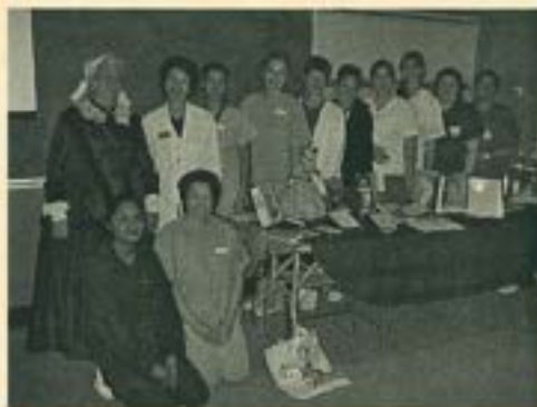
Florence Nightingale joins the Kwantlen students