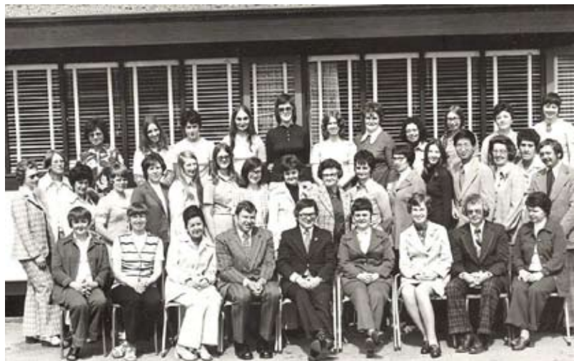
Skeena Health Unit: 1974