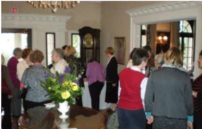
Members and Guests enjoying the event