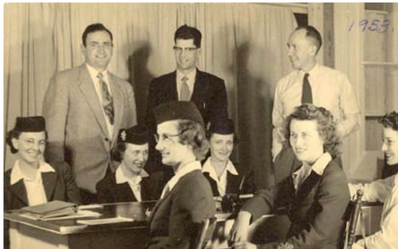
1953 Health Unit

and one of the main motivators for writing the book. In fact, the first thing I did when the books arrived was to take her a copy--she knew I was doing something because I had interviewed her and borrowed some of her pictures, but the actual book was a complete surprise to her."