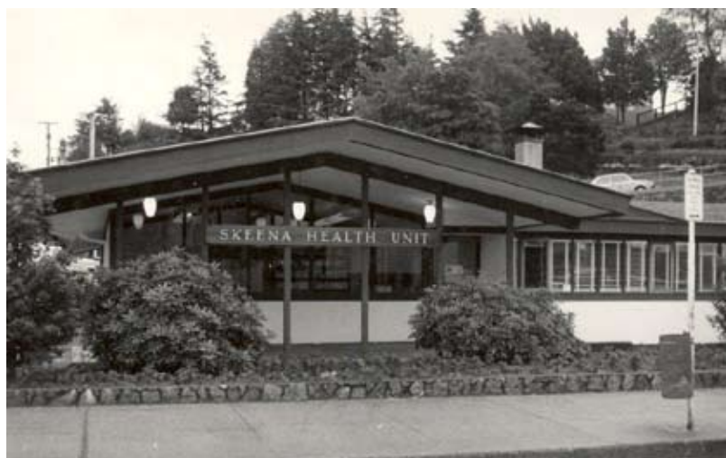
Skeena Health Unit Prince Rupert