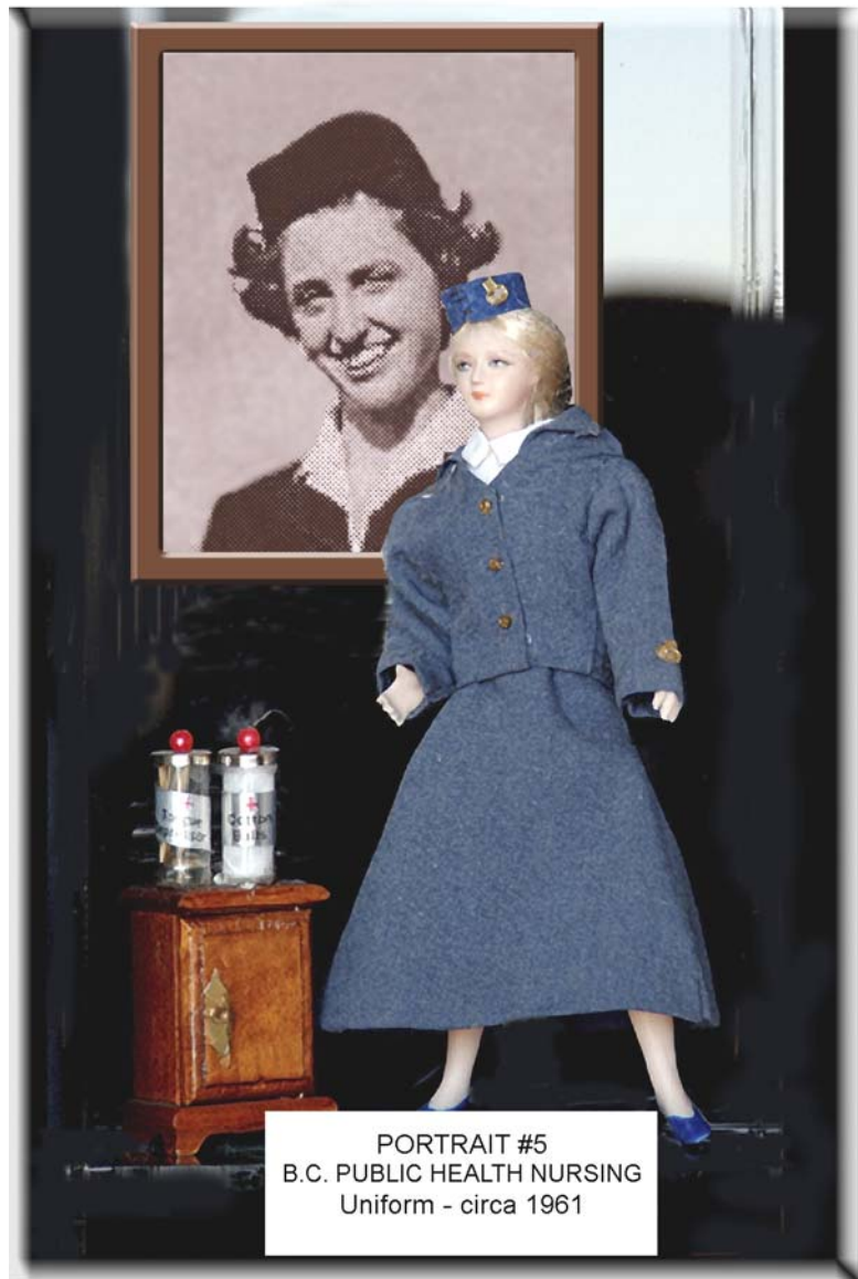
PORTRAIT #5 B.C. PUBLIC HEALTH NURSING Uniform - circa 1961

At the turn of the 20th century, practicing nurses in B.C. functioned independently in the community. Military service, public health nursing, private duty and home nursing comprised the most common types of nursing, giving nurses a high profile and a position of prominence in the community. The advent of hospitals changed this. Nurses lost their independent status to organized institutions. Early public health nurses were the forerunners of the current independent nurse practitioner role.