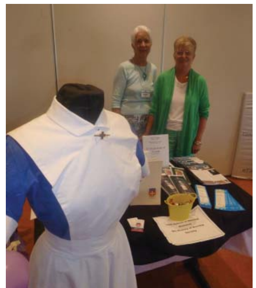
BCNU Day at VGH