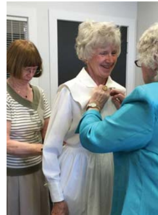
See more photos from this event on page 2