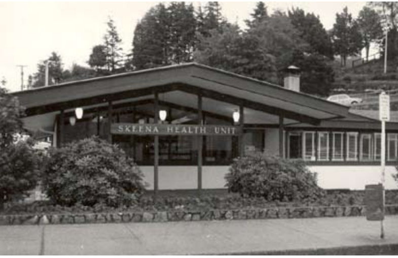
Skeena Health Unit Prince Rupert