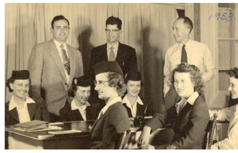
1953 Health Unit

and one of the main motivators for writing the book. In fact, the first thing I did when the books arrived was to take her a copyshe knew I was doing something because I had interviewed her and borrowed some of her pictures, but the actual book was a complete surprise to her."