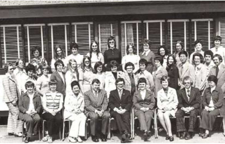
Skeena Health Unit: 1974